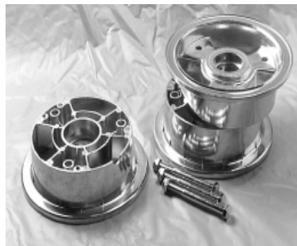
5" Aluminum Wheels are 3" Wide