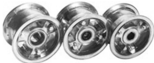
6" Aluminum Wheels are 4" Wide